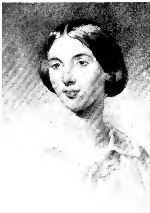
JESSIE BENTON FRÉMONT.

FRÉMONT, Mrs. Jessie Benton , born in Virginia, in 1824. She is a daughter of the late Hon. Thomas Hart Benton, of Missouri, who was conspicuous as editor, soldier and statesman, and famous for thirty years in the United States Senate, from 1820 to 1851. During the long period of Col. Benton's public life Jessie Benton was an acknowledged belle of the old régime. She possessed all the qualities of her long and illustrious ancestry, illuminated by her father's record, and was the